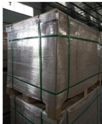
✓ Wrapped for shipment