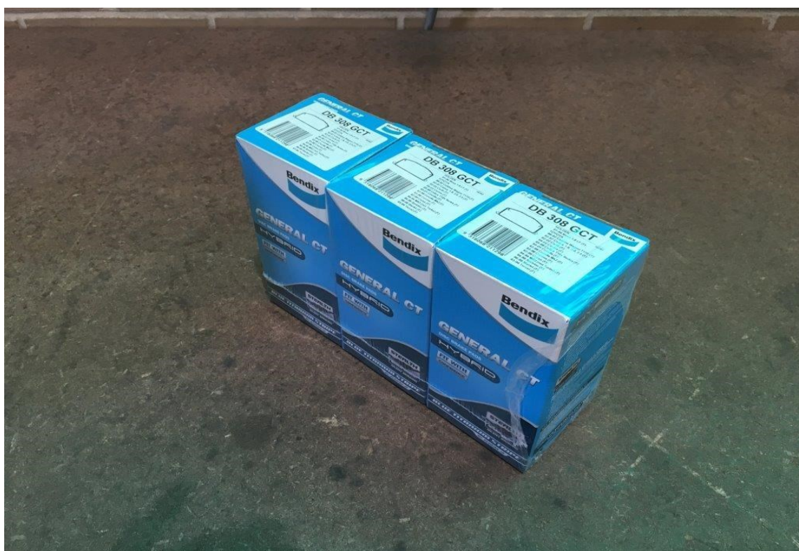
“Medium box” bundle of 3: packed three sets side-by-side