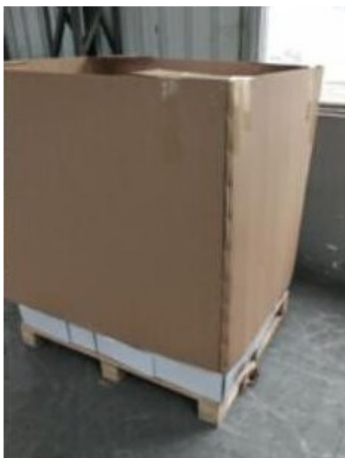
✓ Shipping case

Goods are to be supplied in a large cardboard bin with full base and cap. Footprint must be no larger than 1120mm by 1120mm. The shipping case must have the 4 wooden corner braces supporting the load and not the product (from floor level to top and with a wooden top layer).