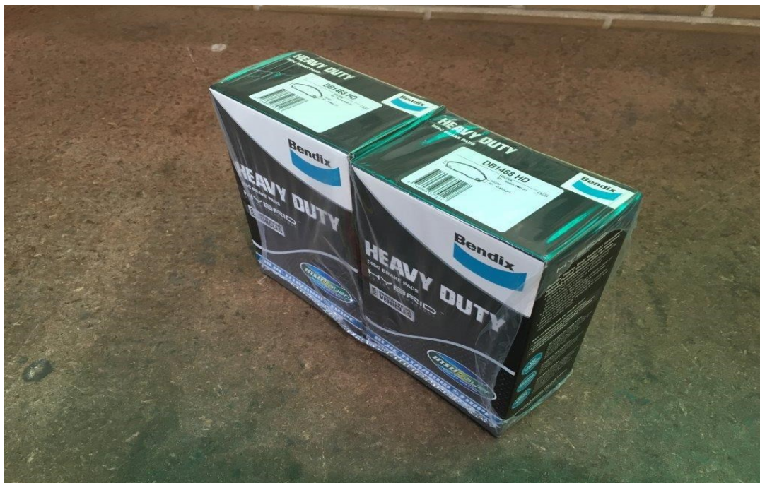
“XL & XXL box” bundle of 2: packed two sets side-by-side