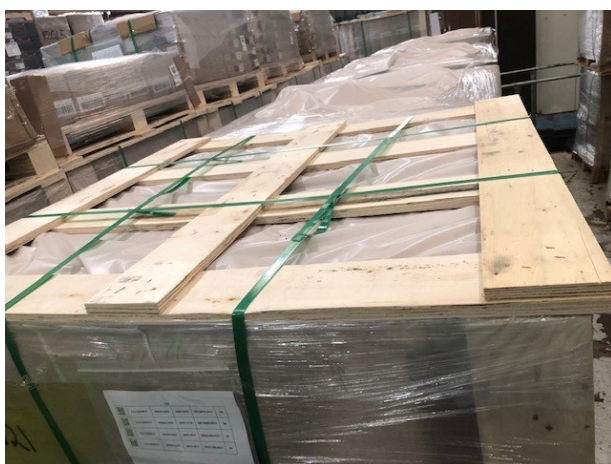
✓ Load properly supported