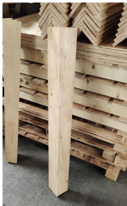
✓ Edge supports